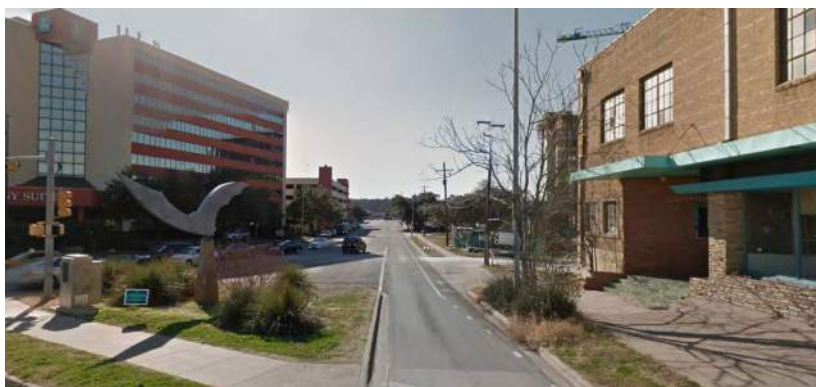
Existing view turning right from Congress Avenue

The existing free-right turn at Congress Avenue and Barton Springs Road creates an unsafe crossing for people walking or biking. This right turn could be removed and reassigned to be public space that adds a unique gateway into the district from downtown. Rain gardens would be incorporated into the new plaza.