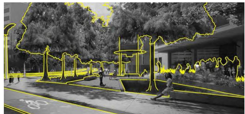
Proposed Rain Garden and Streetscape