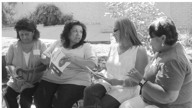
Ladies from Class of 1953 with their Falcon yearbook.

Some photos by current Fulmore Middle School journalism students, taken on September 24, 2011.